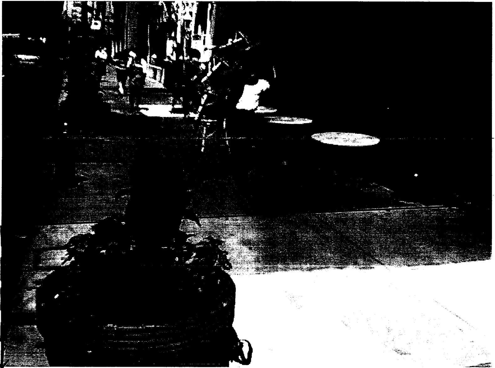
10 feet, curbside